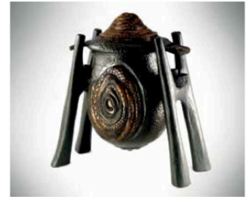
Pat Kramer, Gatekeeper , 2008, Cuban mahogany container with paldao legs, 13" h x 12" dia, Artist Photo

OPPOSITE Kay Khan, Mythology (Detail) , Silk and cotton, quilted, 36" x 15" x 6.5", Photo Credit: Wendy McEahern, Represented by Snyderman-Works Gallery